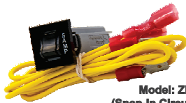
Model: ZK005 (Snap-In Circuit Breaker Also Available in 3A)