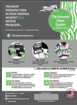
Universal Zebra System