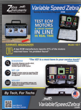
Variable Speed Zebra